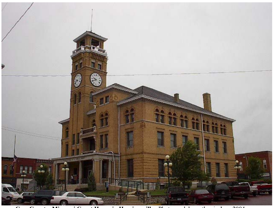
Cass County, Missouri Court House in Harrisonville.