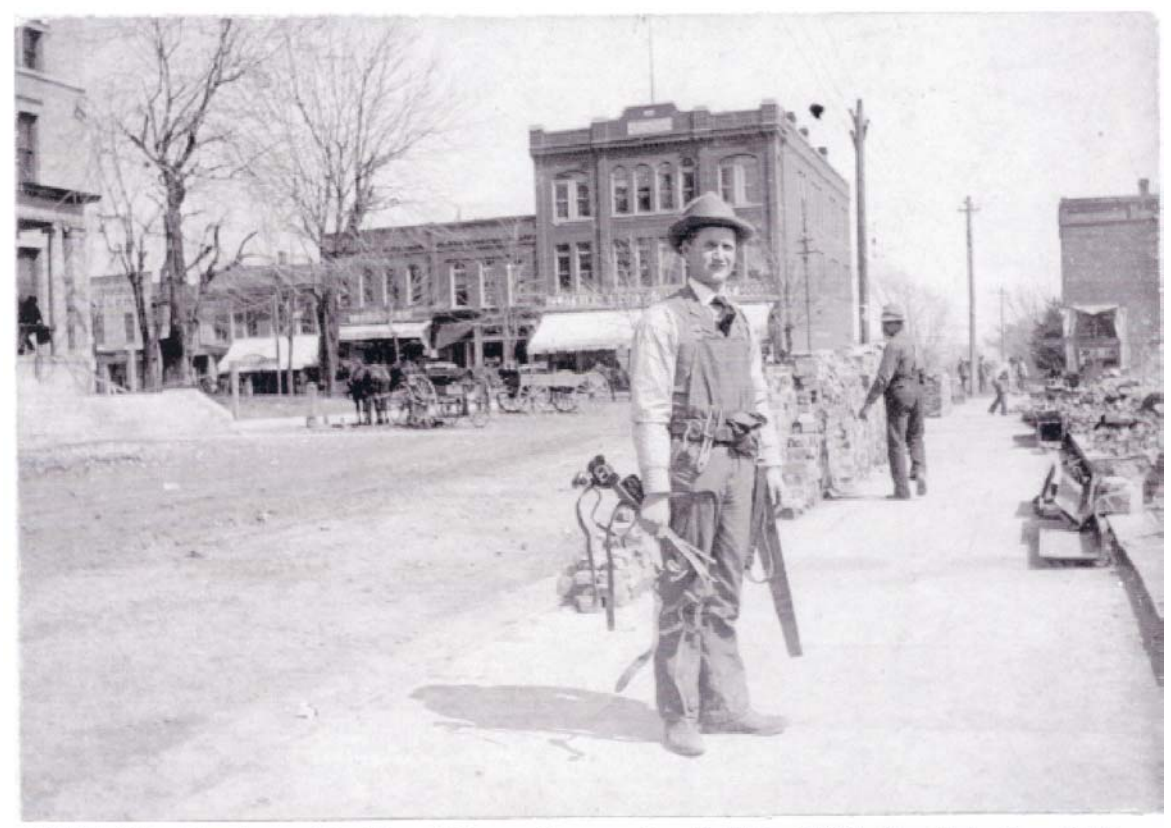
PH26 City:Harrisonville Street Scene:Square, South Side 1900 after Feb. fire BW