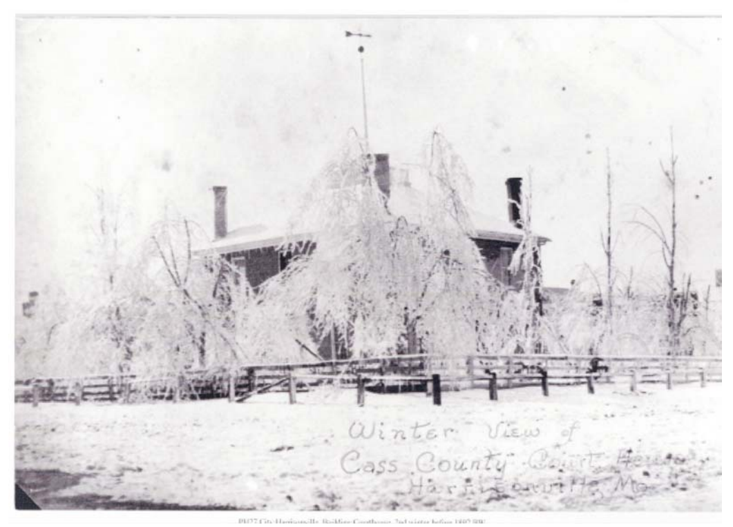
Figure 1. The Cass County Missouri Courthouse in Harrisonville, circa 1890. The wind instruments can be clearly seen rising above the building.

Rain gage – In 1897, the rain gage was a "Weather Bureau" gage located 25 feet northwest of house. In 1906, the gage was described as being 3 feet above the ground and 10 feet to building north and 20 feet to trees south.