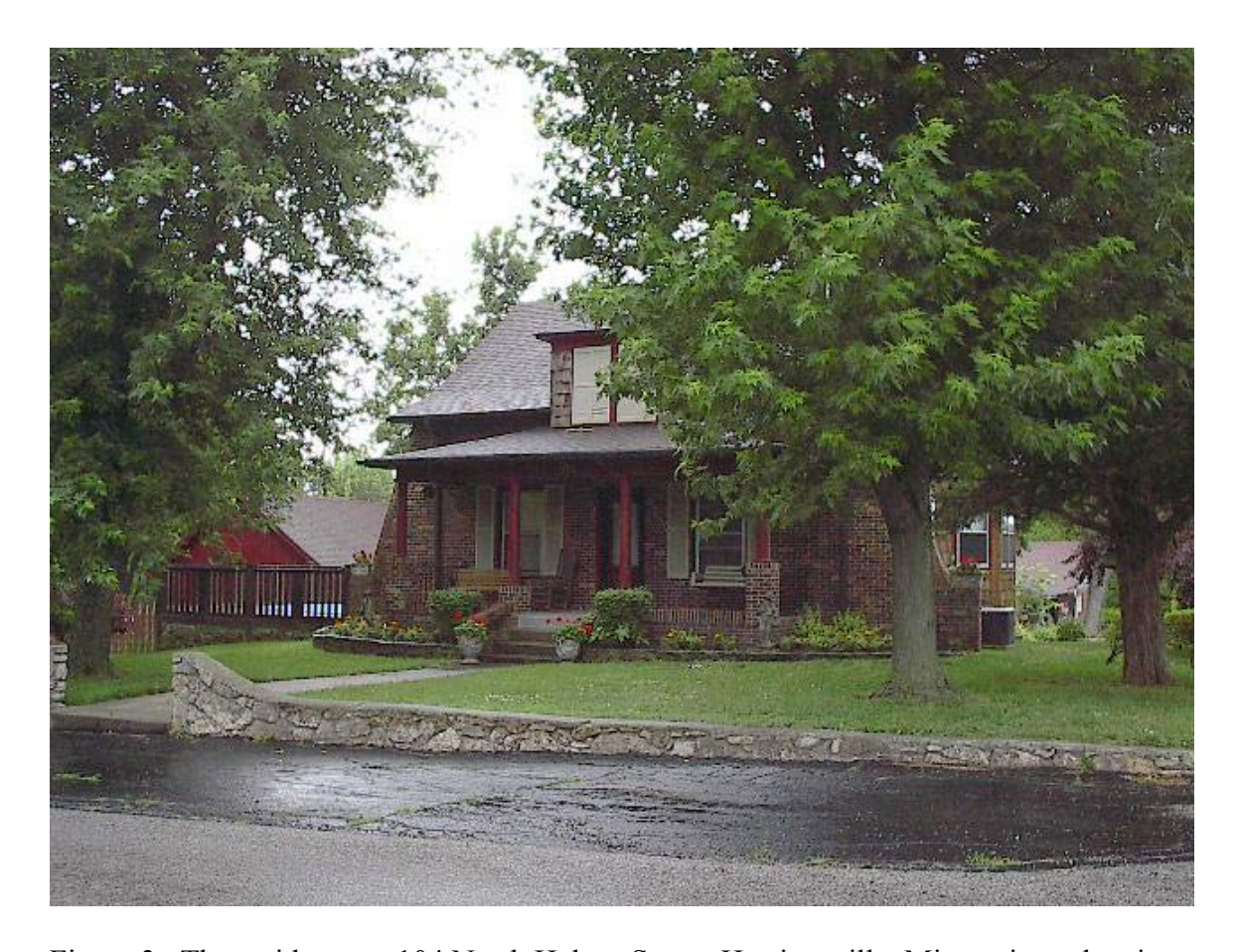
Figure 3. The residence at 104 North Halsey Street, Harrisonville, Missouri as taken in June 2004. Photograph was taken looking southwest from the corner of Haley and Walnut Streets. The weather instruments would have been located in the area to the rear and left of the house.

1972 – 1984: Beginning on November 19, 1972, Billy E. Weddington began observing from his home at 1100 East Pearl Street. Mr. Weddington continued observations until November 20, 1979. His widow, Viola Weddington, took over the observing duties on November 28, 1979. This was only a short move to the southwest as the Weddington's backyard cornered the Patterson's back yard. See Figure 4. The last observational form received for Harrisonville was for April 1984, the station was declared inactive in November 1984, and it was officially closed on August 2, 1989. For a closer look at the change of observer see the Observer Story section at the end of this report.