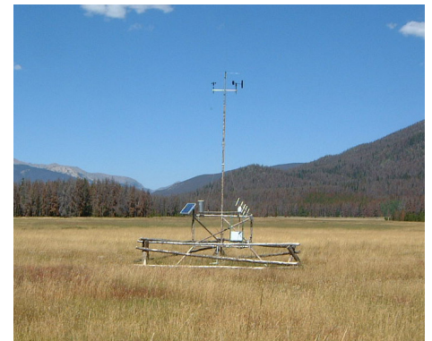
Harbison Meadow, Colorado RAWS in Rocky Mountain National Park

their own analyses. However, in recent years non-fire interests in the data, such as ecosystem management and wind energy, have evolved. These days WRCC receives requests from a wide variety of users ranging from research to general public use. WRCC maintains a Web site to retrieve RAWS data as well as a large number of data summary statistics and graphs. These summaries include daily and monthly statistics and time series, wind rose graphs and frequencies, data inventories, and station metadata and photos. The WRCC RAWS Web link is http://www.raws.dri.edu/index.html .