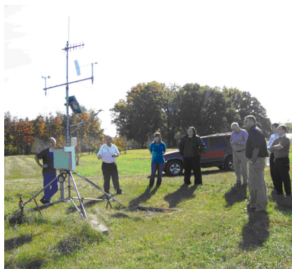
NWS personnel visit an HPRCC AWDN station in Lincoln, Nebraska.

The workshop proved to be an opportune place to talk about collaborations and the needs of specific NWS offices. One major outcome of the workshop was the addition of new data to the Norfolk, NE ThreadEx station. Collaborations continue to update additional datasets.